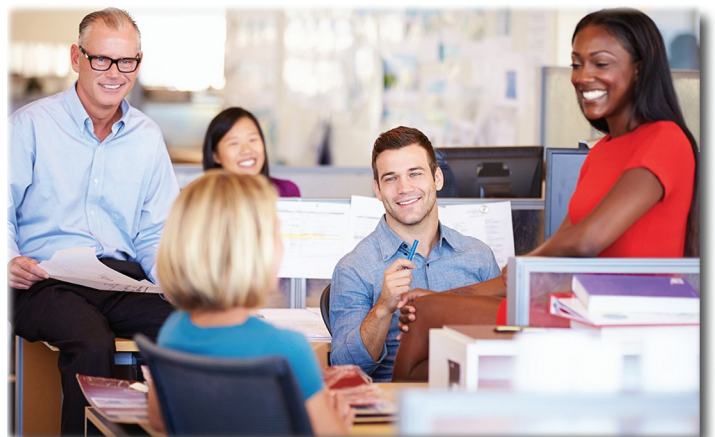
Office Space: Open Floor plan.

Add Paging, music, and or Emergency All-Call functions to your masking system at NO ADDITIONAL CHARGE . Ask us how.